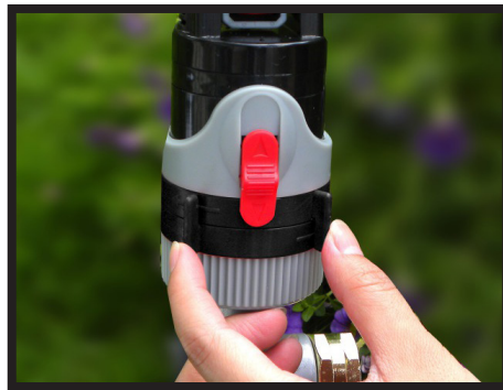
Watering Width Adjustment When the red lever is down (shown above) you can adjust the watering width by moving the dial left and right.

To allow the sprinkler to rotate 360° push red lever all the way up.