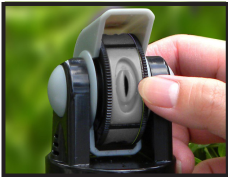
Spray Pattern Adjustment Move the dial up and down.

Thank you for your purchase of the German Circular Sprinkler. To get started, attach the sprinkler head to the base. Be careful not to overtighten as this can cause breakage. For best results, please review these helpful tips.